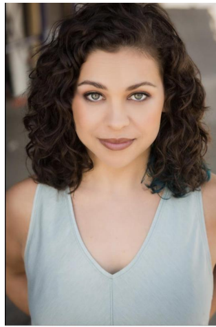
Ariel Reich Chorus